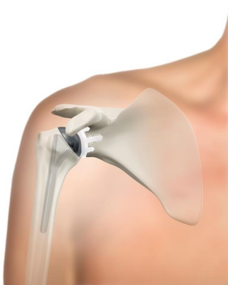
Figure 2. Anatomic Shoulder Replacement

With a reversed total shoulder replacement, the normal structure of the shoulder is “reversed.” The ball portion of the implant is attached to the scapula (where the socket normally is) and the artificial socket is attached to the humeral head (where the ball normally is) (Figure 3). This allows the stronger deltoid muscles of the shoulder to take over much of the work of moving the shoulder, increasing joint stability. A reversed procedure is use for patients with a severely torn and compromised rotator cuff. It is also commonly used in revision surgery cases.