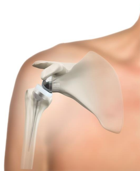
Figure 3. Reverse Shoulder Replacement